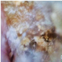
Occluded Ear Canal, Client experiencing hearing loss, ear drum not visible, treatment plan started prior to microsuction